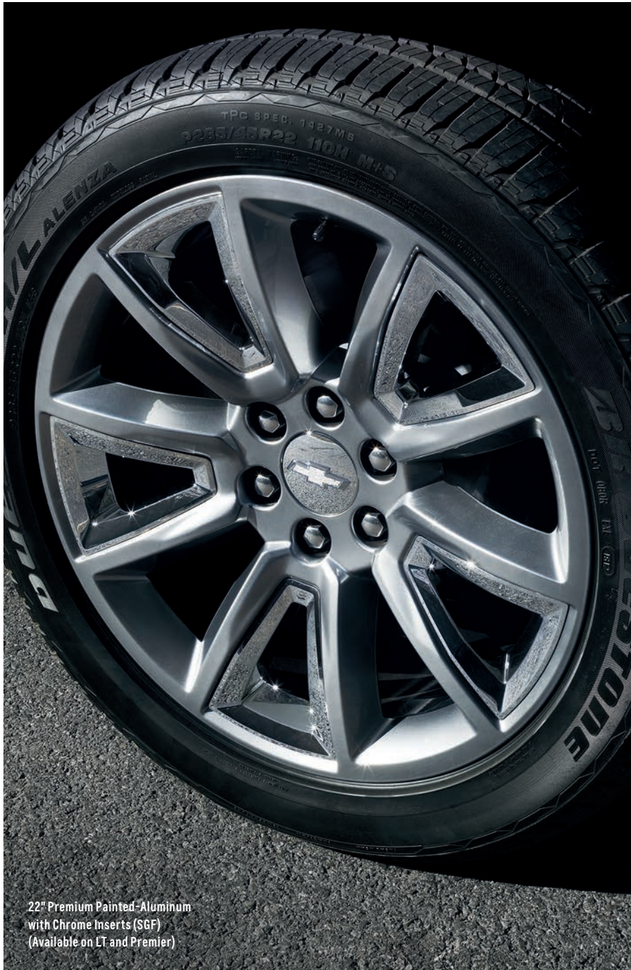
22" Premium Painted-Aluminum with Chrome Inserts (SGF) (Available on LT and Premier)