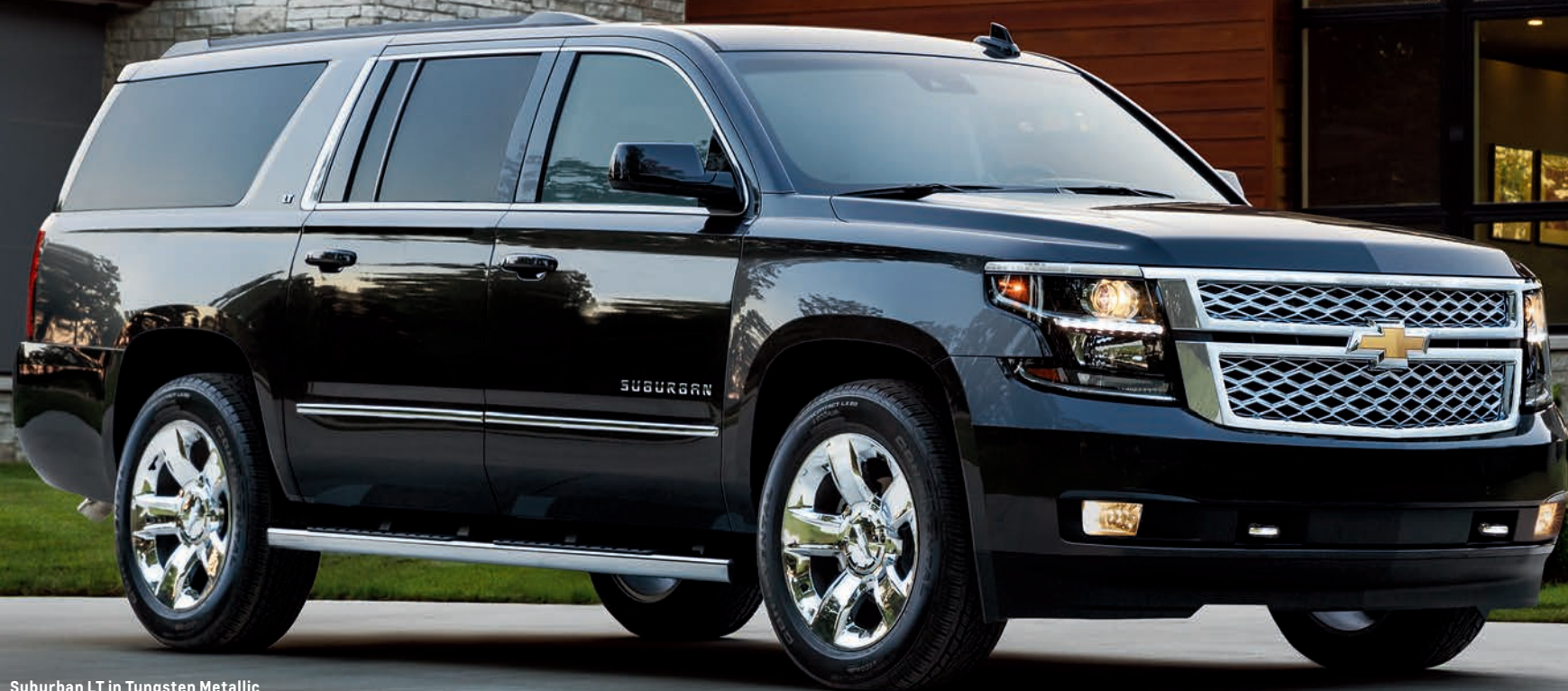
Suburban LT in Tungsten Metallic with available Signature Package.