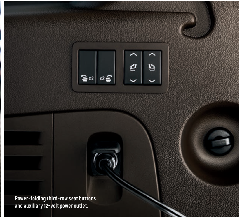
Power-folding third-row seat buttons and auxiliary 12-volt power outlet.