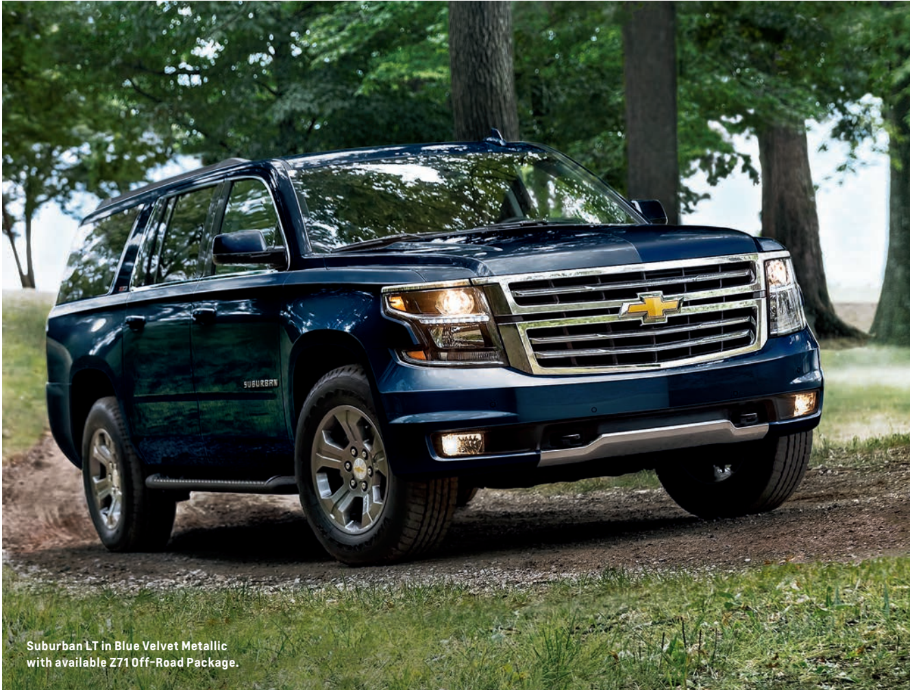
Suburban LT in Blue Velvet Metallic with available Z71 Off-Road Package.

DRIVE ON. Suburban with the available Z71 Off-Road Package takes capability to an even higher level. Z71 features a special off-road suspension, Autotrac® 2-speed active transfer case, Hill Descent Control, plus Front and Rear Park Assist. Z71 has the style to match its hardware, with a unique grille design, 18-inch wheels with all-terrain tires and special “Z71” identification.