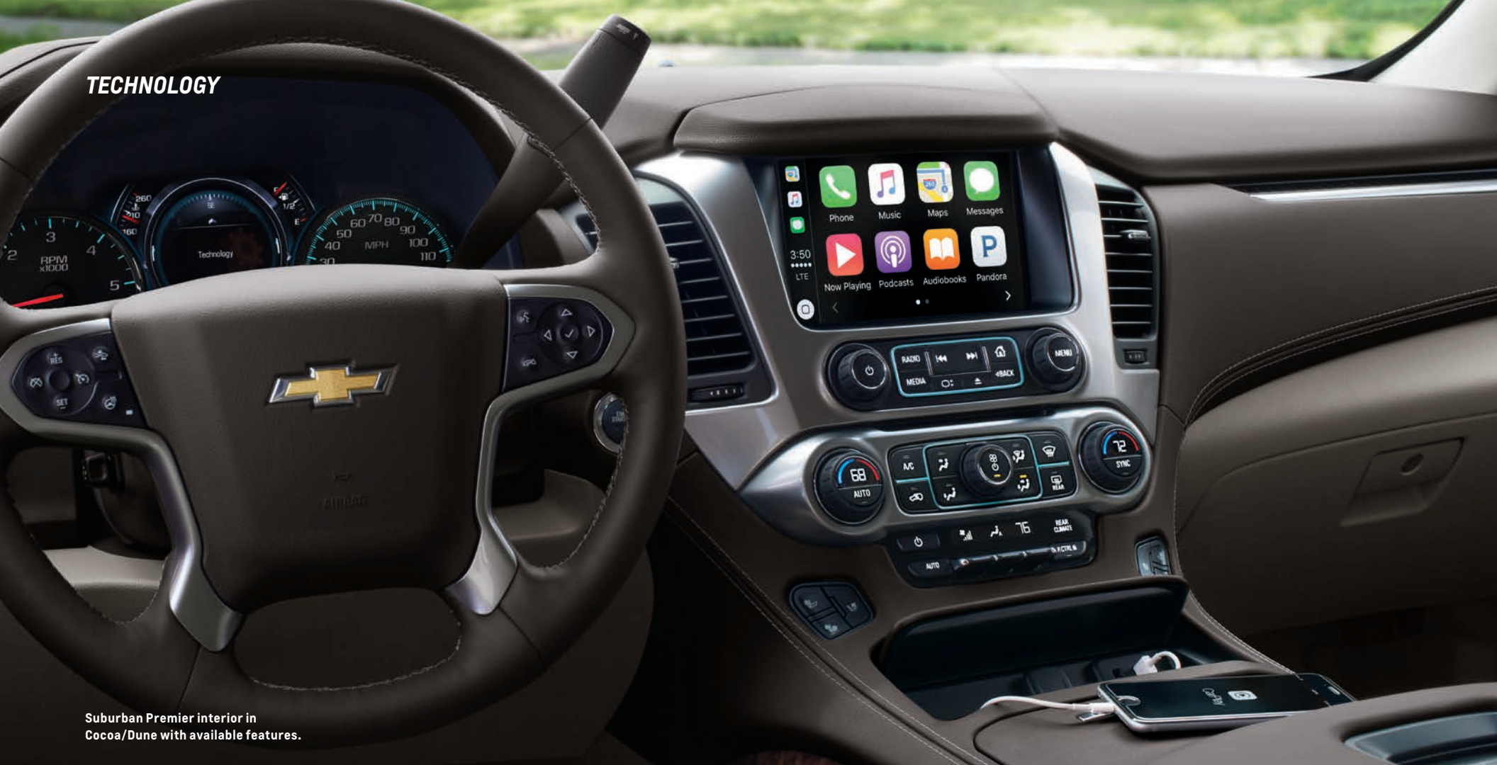
Suburban Premier interior in Cocoa/Dune with available features.