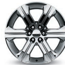
22" Chrome-Aluminum (SMI) (Available on LT and Premier)