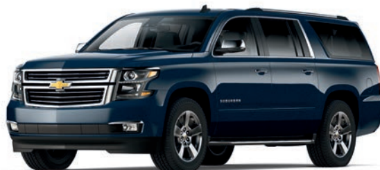
BLUE VELVET METALLIC