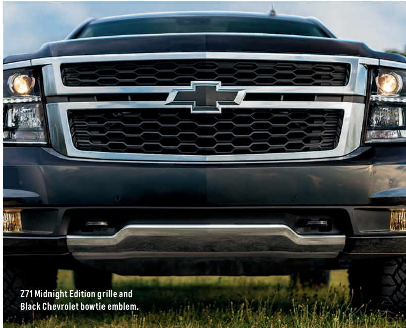
Z71 Midnight Edition grille and Black Chevrolet bowtie emblem.