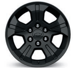
18" Black-Painted Aluminum (REG) (Included with Z71 Midnight Edition)