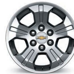
18" Painted-Aluminum (RCV) (Included with Z71 Off-Road Package)