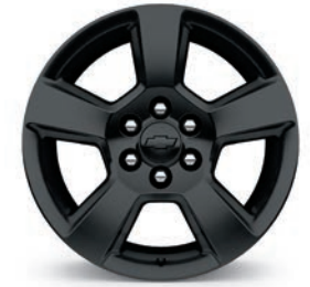
20" Black-Painted Aluminum (NZQ) (Included with LT Midnight Edition)