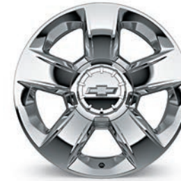
20" Chrome-Aluminum (RD2) (Available on Premier; included with LT Signature Package)