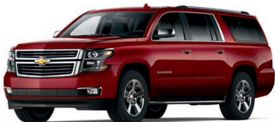
SIREN RED TINTCOAT 1