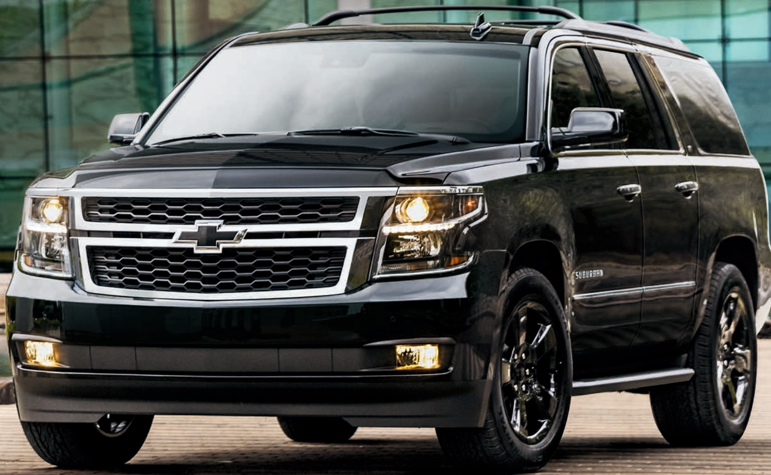
Suburban LT Midnight Edition in Black.