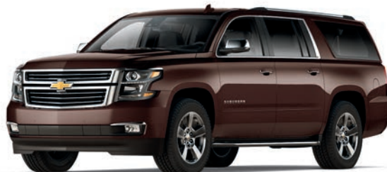
HAVANA METALLIC 3