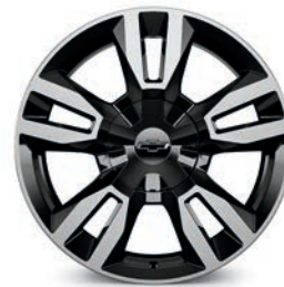
22" Gloss Black Aluminum with Custom Silver Accents (SGK) (Included with RST Edition)