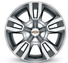
22" Ultra Bright Machined-Aluminum with Bright Silver Finish (SIY) (Available on Premier)