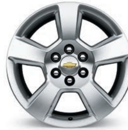
20" Polished-Aluminum (RD4) (Standard on Premier; available on LS and LT)