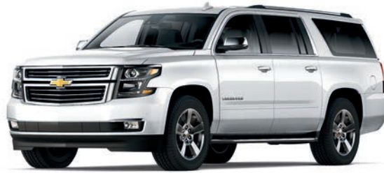
IRIDESCENT PEARL TRICOAT 1,2