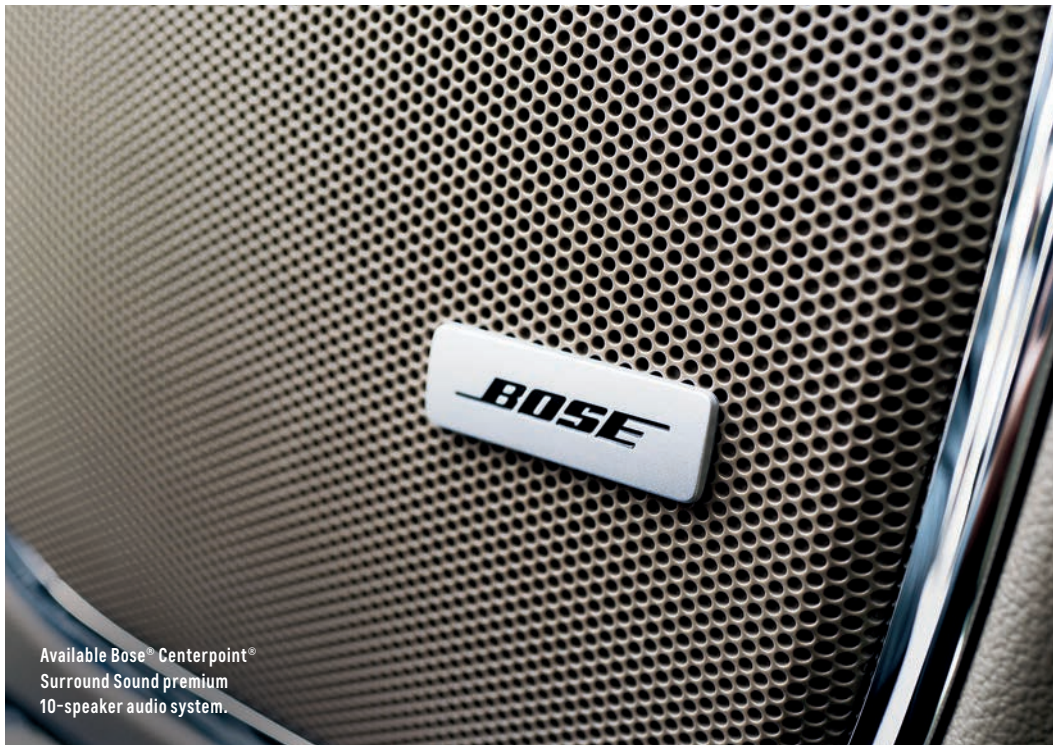
Available Bose® Centerpoint® Surround Sound premium 10-speaker audio system.