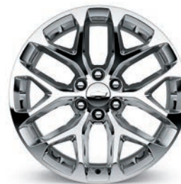
22" Chrome-Aluminum Multi-Featured Design (RPT) (Available on LT and Premier)