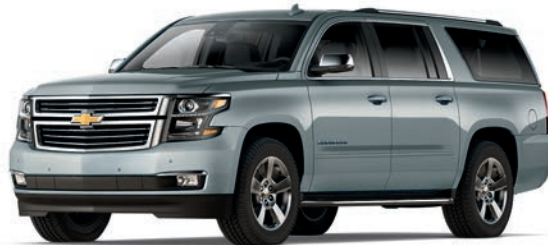
SATIN STEEL METALLIC