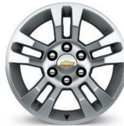
18" Aluminum with High-Polished Finish (PZX) (Standard on LS and LT)