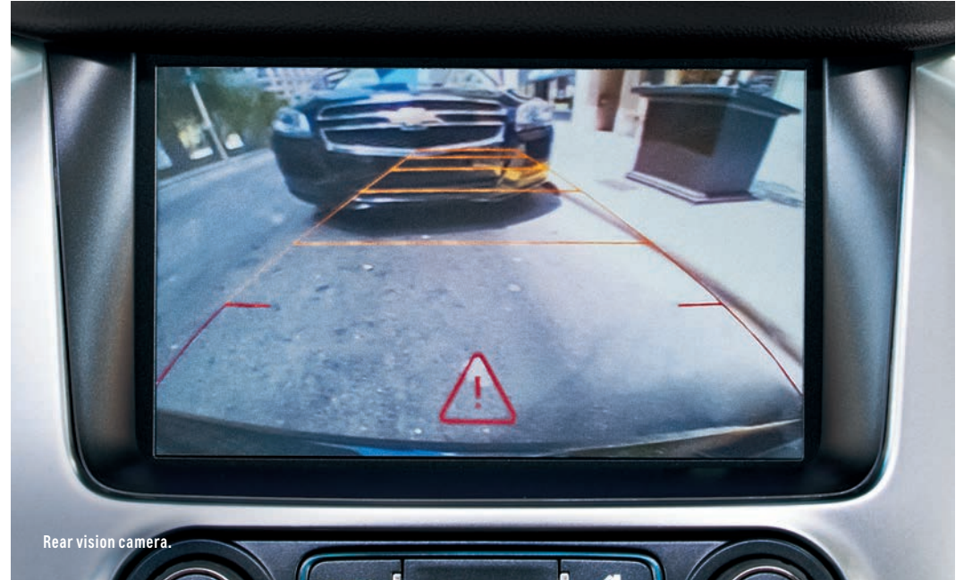
Rear vision camera.